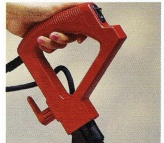
• Convenient Power Switch in handle.

The Millennium 2000 series is twice as powerful as previous models and has up to 40% longer motor life.