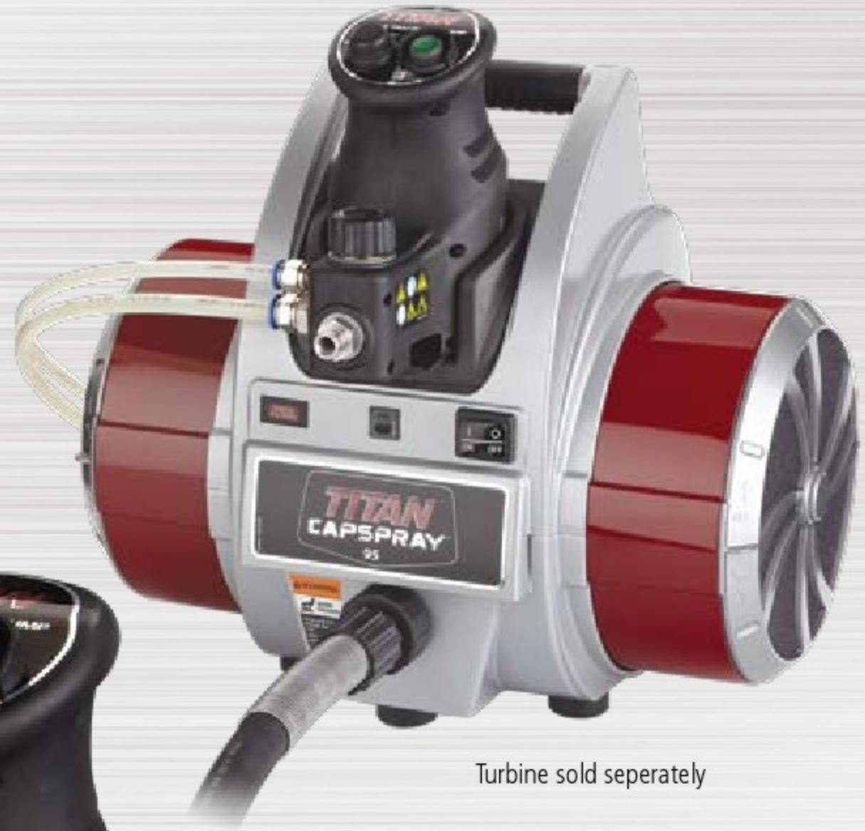
Turbine sold separately

Designed for extended use on jobs where frequent quart cup refilling is not desirable. Recommended for fine finishing professionals and contractors with serious finishing projects.