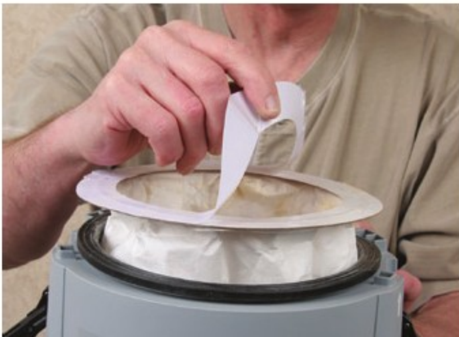
Self-adhesive, disposable bag for fast and clean bag removal.

Remove the paper label to expose the adhesive. Fold the bag in half to stick the adhesive together. Remove the bag.