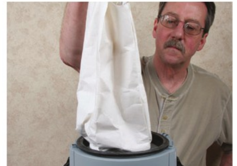
Extra Dust Bags Available: 1471097500 - 10-Quart Dust Bag (5)