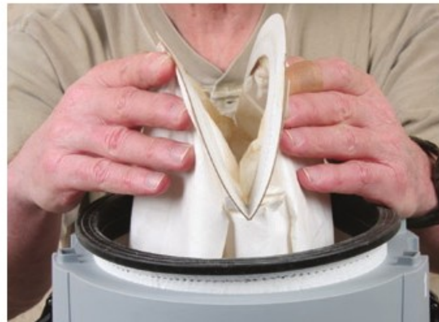
Large 10-quart capacity bag captures all the dust and dirt.