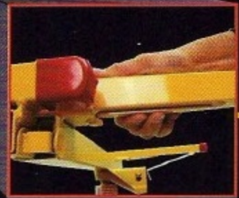
Easy action Cross Arm release simplifies and speeds disassembly.