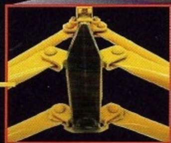
Jam resistant Tripod Base simplifies assembly / disassembly.

We improved the design of the PANELLIFT® DRYWALL LIFTERS. The upgrades are reflected in the pictures below. The upgrades reflect our greatest effort to improve our products to meet customer expectations and exceed the industry standards.