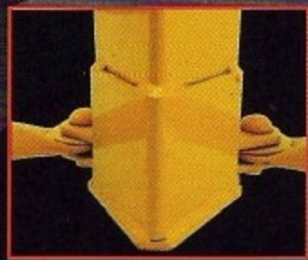
Heavy duty Frame Base and Center Leg stand up to heavy use.